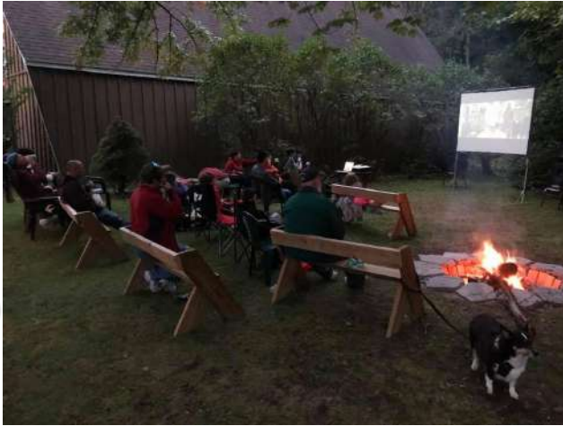
Youth Group Outdoor Movie